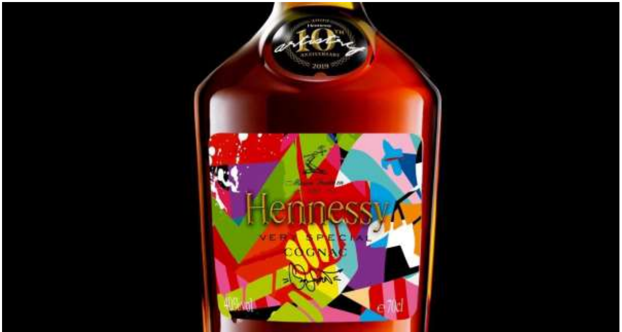
Artist: Osa Seven;

Work title :( Cognac decanter) Hennessy; Source: https://asia.hennessy.com/