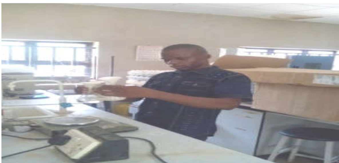
Fig. 3: Removal of 200 millimeter (10%) of the suspended load sample out of the 1000 millimeter (one liter)