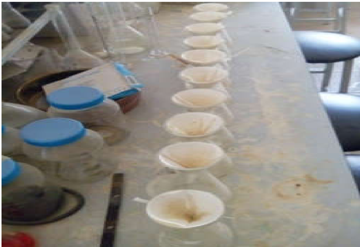
Fig.4: The filtration of 10% suspended load sediment sample