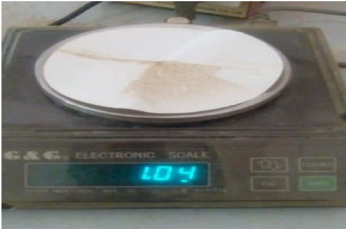
Fig. 5: Weighing of filtered sampled sediment