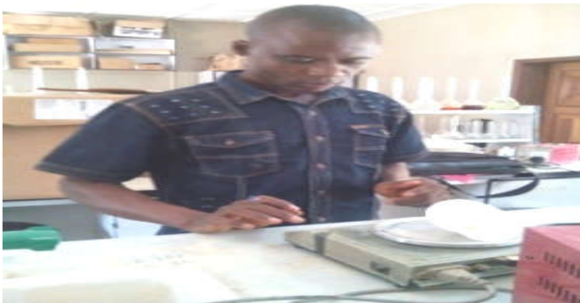
Fig. 2: Weighing the volume of the filter paper

Filtration method was done by removing twenty percent (10%) of each sample and filtered it on filtering paper. After filtration, the sediment on the filtering paper was weighed.