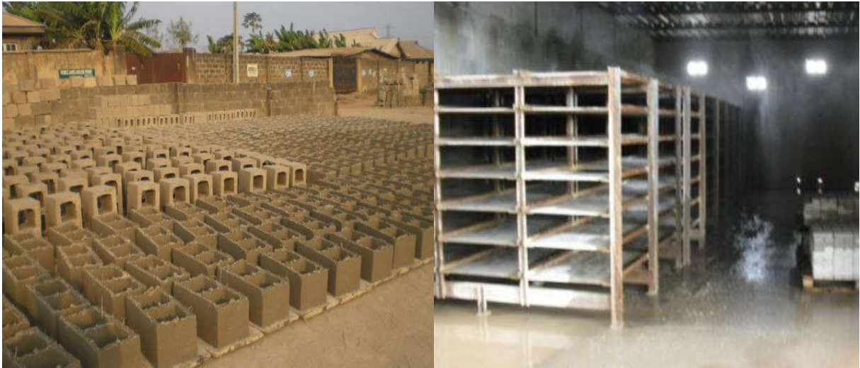
Figure 2: Air drying and Storage

immediately after impact. Commercial production is by a power driven automated machine with gang moulds that produce thousands of units each day.