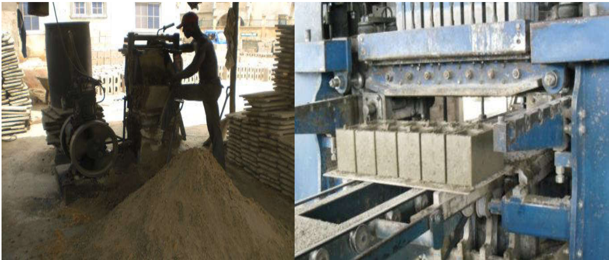
Figure 1: Batching and Moulding of Blocks

The production of sandcrete block may be carried out manually or mechanically. The first stage in the production of sandcrete blocks involves the batching of materials (Figure 1). This is carefully determining the proportion of the mix in order for the resultant blocks to meet specific standards. Batching can be carried out either by weight or by volume, small- scale firms typically practicing the later, using head-pans or wheelbarrows. Typically, blocks for load bearing walls should have a mix of one head pan of cement to six head pans of clean sand (1:6). Where a large number of blocks are to be manufactured, batching by weight is the norm, whereby the raw materials are discharged into a weigh batcher, which measures the correct proportion of dry materials for the mix and the mixing done by mechanical means (Ojo, 2016). A concrete mixer is often used, but a pan type mixer should be preferred where it is available as a better result is obtained. The mixing should continue until the cement contents are evenly mixed with the sand. It advisable to mix dry first then add water in sprays. Only sufficient water to enable the hydration of the cement should be added. The mixture should cake when is pressed in between the palm without bringing out water (Obande, 1996).